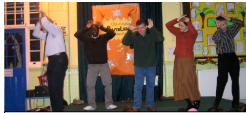
The Christmas Factor: Rudolph the red nosed donkey is rejected as a song...